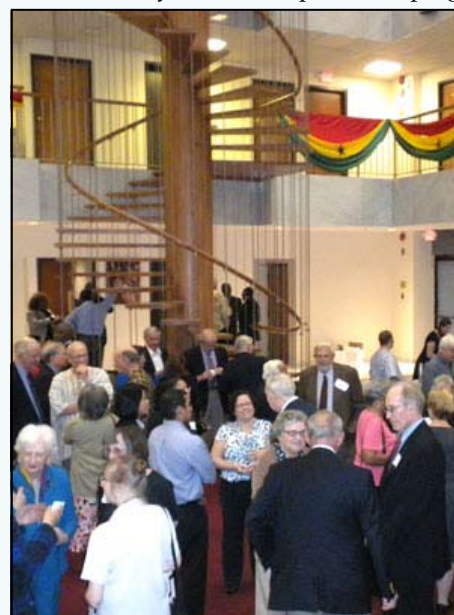
Attendees get (re)acquainted at the reception.

The dinner buffet, catered by Ghana Café, included