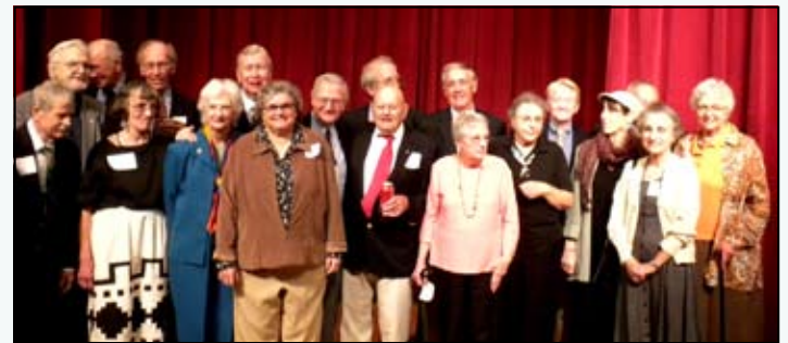
RPCVs from Ghana I were well represented.